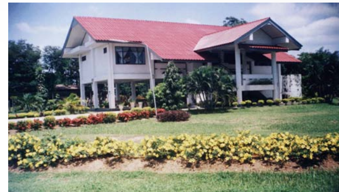
Primary Care Units (PCUs)